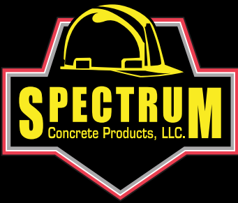
PLATE WASHERS TECHNICAL DATA SHEET